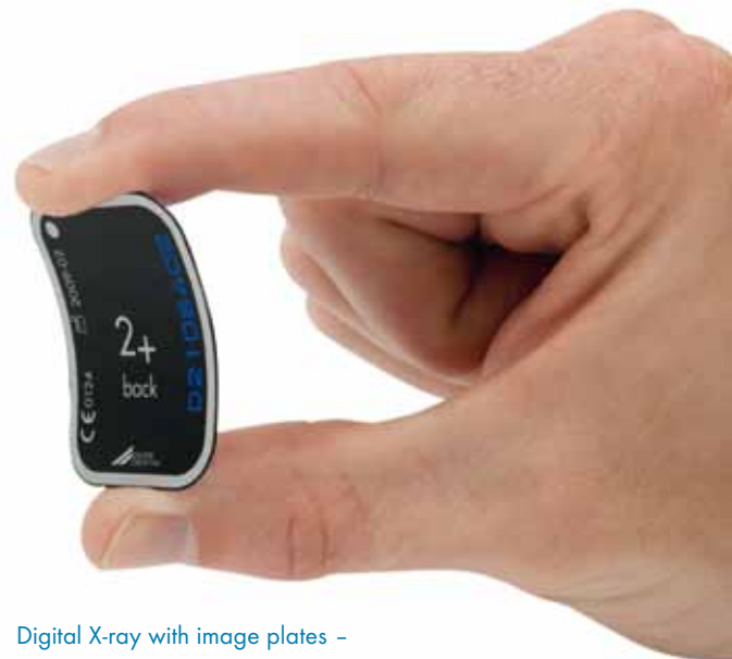
Digital X-ray with image plates – you can't get more flexible than that

The VistaScan image plate cleaning cloth thoroughly cleans and also disinfects the plate at the same time thus removing any impurities that may appear on an image. The benefit is a lasting, optimal image quality.